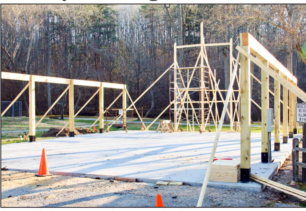
A new pavilion is under construction at the backside of Meeks Park, to connect to the gazebo. This image was taken in early March. The project is further along now.